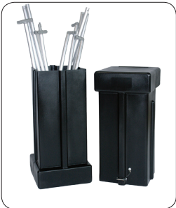
Case fits with Wave tubes and graphics